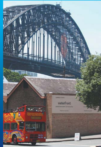
Explore Sydney and Bondi