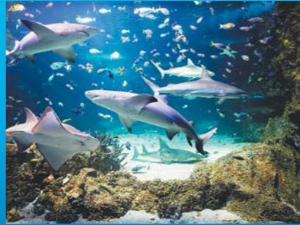
Walk underwater at Sydney Aquarium