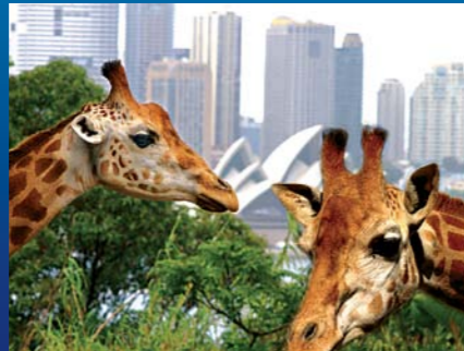
Visit Taronga Zoo by boat