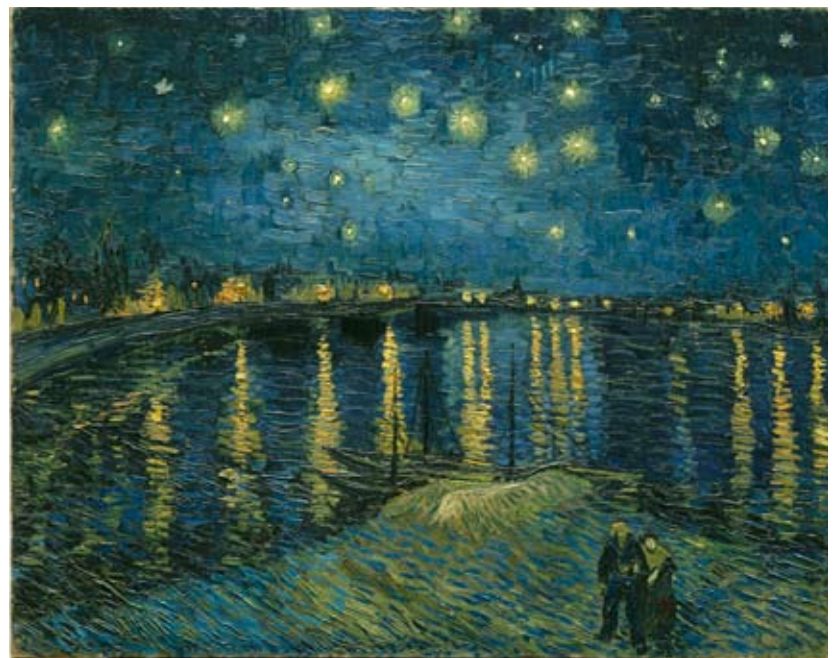
Vincent van Gogh Starry night 1888 Musée d'Orsay, Paris