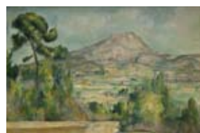
Paul Cézanne Mount Saint-Victoire c 1890 Musée d'Orsay, Paris

At the conclusion of the day, you will be transferred back to Canberra station to connect with the 5.03pm train service to Sydney.