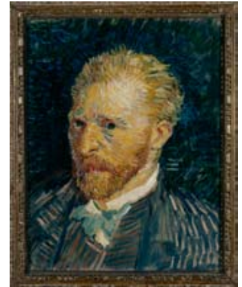
Vincent van Gogh Portrait of the artist 1887 Musée d'Orsay, Paris

†Price includes: Return economy class rail travel Sydney to Canberra, all touring as indicated and entry to the exhibition.