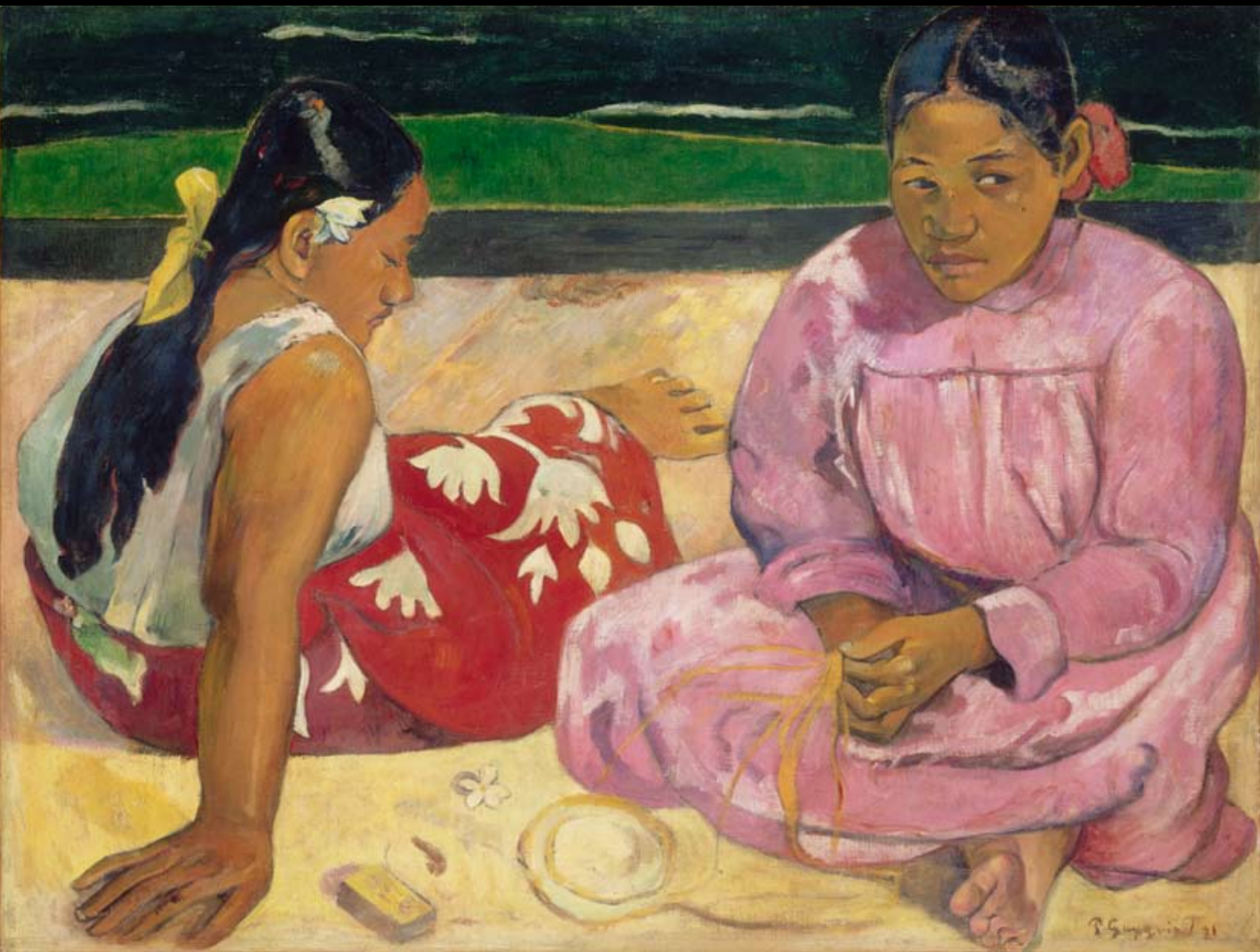
Paul Gauguin Tahitian women 1891 Musée d'Orsay, Paris

POST-IMPRESSIONISM FROM THE MUSÉE D'ORSAY