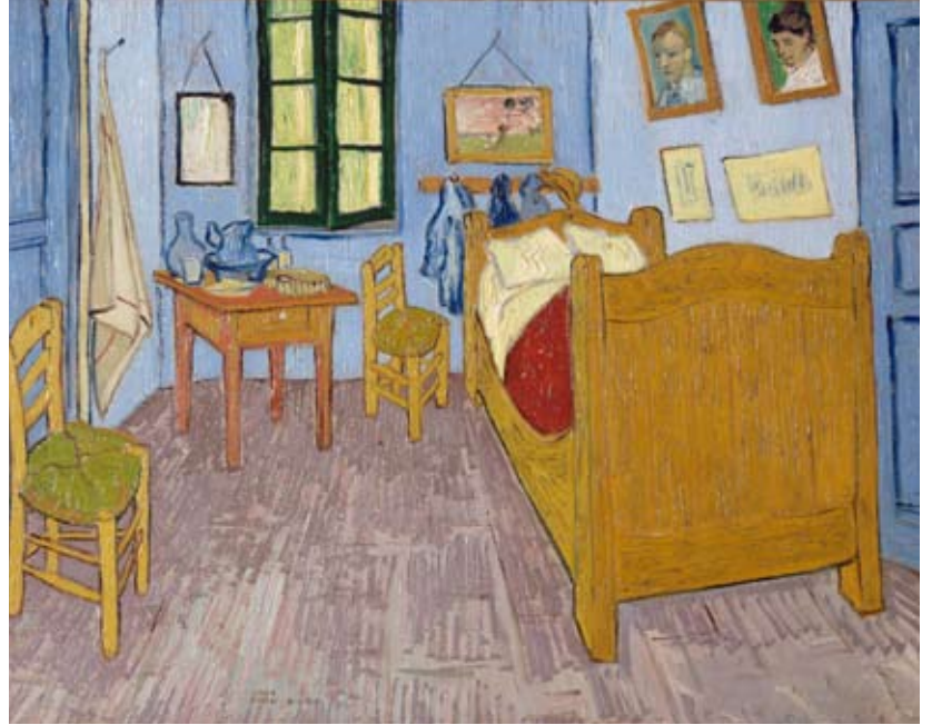
Vincent van Gogh Van Gogh's bedroom at Arles 1889 Musée d'Orsay, Paris

Visitors will be captivated by Van Gogh's Bedroom at Arles 1889, Gauguin's Tahitian women 1891, Cézanne's beloved Mount Saint-Victoire c 1890, and many other great examples by Post Impressionist painters.