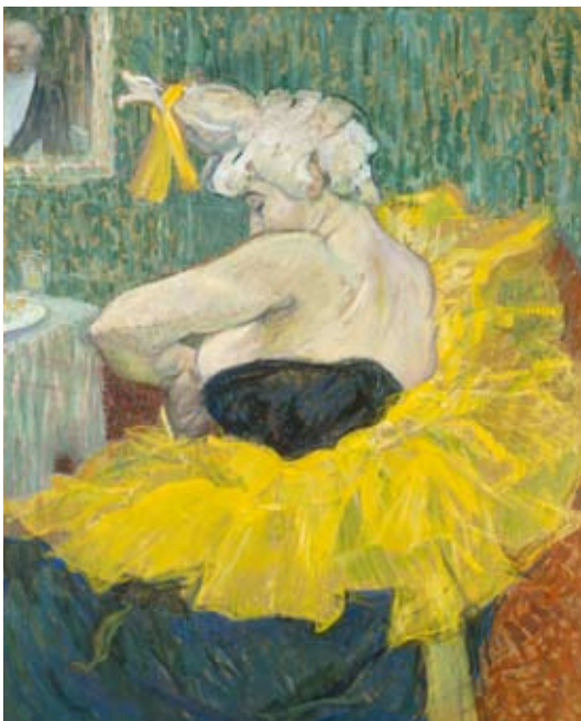
Henri Toulouse-Lautrec Clownesse Cha-U-Kao 1895 Musée d'Orsay, Paris